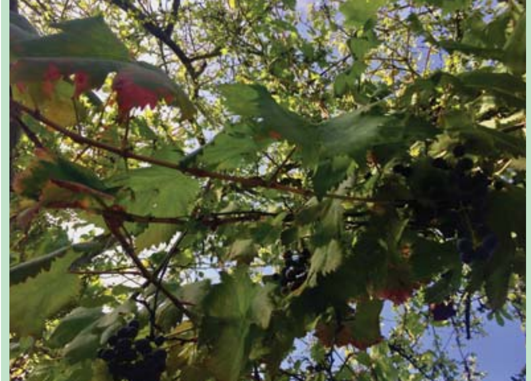
Cynthia's Ribier grapes hanging from her crabapple "grape tree."