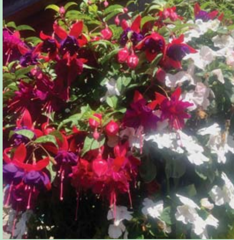
A gorgeous combination of multi-colored fuschias and white impatiens.

Just hang around! We are so blessed to live with four glorious seasons.