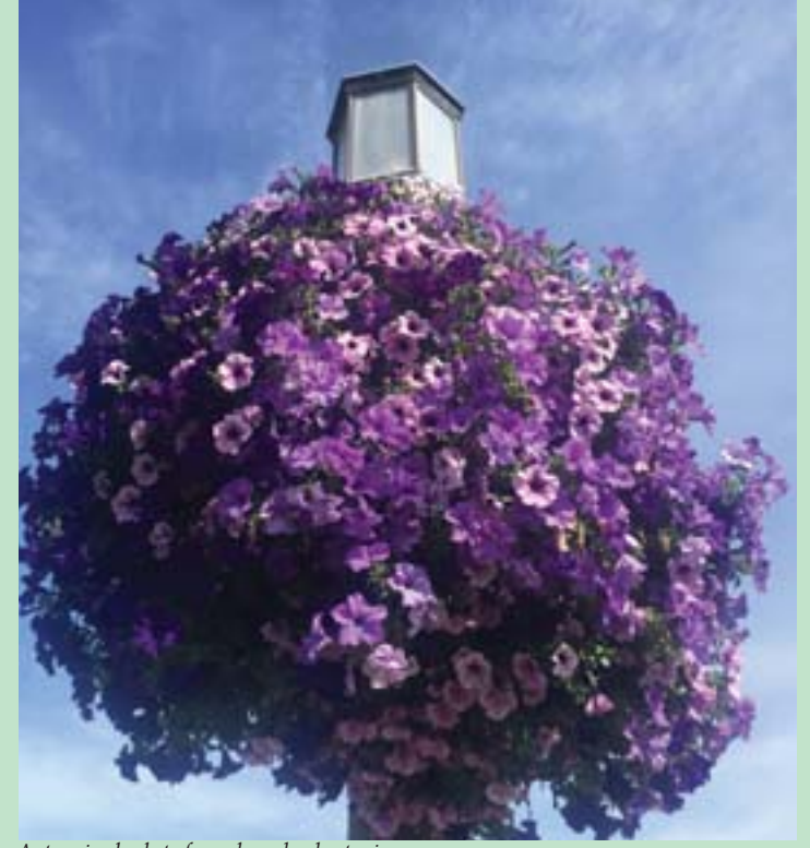
A stunning basket of purple and red petunias.